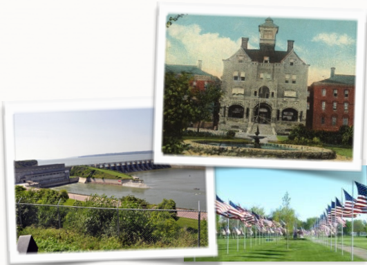
Some photographs— past and present— from Yankton, South Dakota, where we will serve this upcoming July